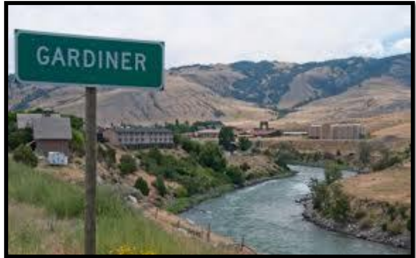
Yellowstone Hot Springs

This one-of-a-kind property is located 25 minutes from Gardiner, MT in the gorgeous Cinnabar Basin. Gardiner has a population of just under 1,000 people, but over four million people pass through the famous Roosevelt Arch each year here at the North Entrance to Yellowstone National Park. Elk roam right through town, and you have all the essentials available. The town of Livingston (population 7,000) is an hour away and you can find art galleries, theaters, a golf course, any type of food you are craving, the 4 th of July rodeo and parade, Farmer’s Market, and many other community events. For a big city feel, the town of Bozeman (pop. 52,000) is 90 mins away, where you can access shopping, Bozeman International Airport, Montana State University, several golf courses, and even more art and culture. The small town of Emigrant is 35 minutes away with establishments such as Chico Hot Springs, Sage Lodge, Follow Yer Nose BBQ, and The Old Saloon. Between The Old Saloon, Pine Creek Lodge, The Montana Music Ranch, and various small local venues, you can see big name music headliners at small, quaint venues with Paradise Valley as the backdrop. The newly developed Yellowstone Hot Springs is just minutes away to soak and take in the scenery.