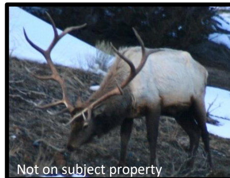
Not on subject property