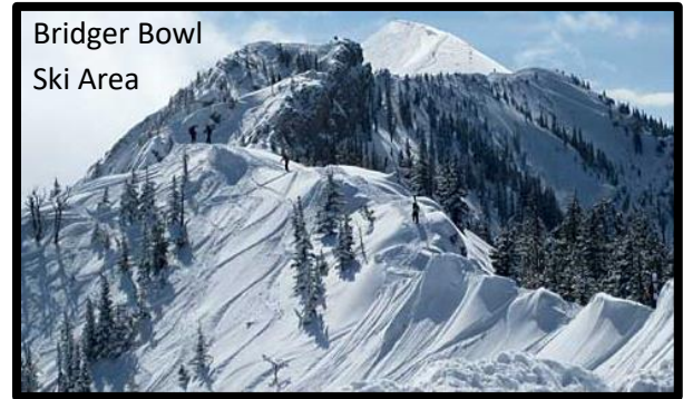
Bridger Bowl Ski Area

simply scenic drives and photography opportunities galore. Yellowstone National Park, where millions of people come from around the world to visit each year, is an hour and a half away. The Natural Bridge Falls and Picnic Area is just a short drive up the West Boulder and Spring Creek and Halfmoon Campgrounds are nearby. Bridger Bowl Ski Area is an hour away and has eight chair lifts, four lodges, and over 2,000 acres of terrain to explore. Besides the fishing on the Yellowstone and Boulder Rivers, you can hike to a nearby high mountain lake. There is something for every outdoor enthusiast in Sweet Grass County.