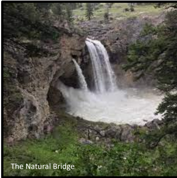
The Natural Bridge

Big Timber is located at the confluence of the Yellowstone and Boulder Rivers and has the Crazy Mountains in the background. It is known for not only its spectacular views, but also the abundance of recreational activities right out your back door. Within minutes you have access to hunting in several mountain ranges and public lands; fishing, floating, paddle-boarding, kayaking, or canoeing on the Yellowstone River; hiking trails to explore any type of terrain or difficulty; cross country or downhill skiing; snowmobiling; or