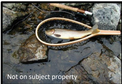
Not on subject property